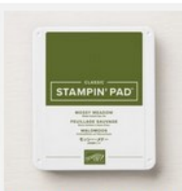
Mossy Meadow Classic Stampin' Pad [147111] $7.50