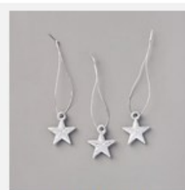
Glitter Star Ornaments [153543] $8.00