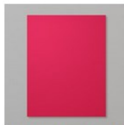
Real Red 8-1/2" X 11" Cardstock [102482] $8.75