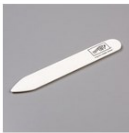
Bone Folder [102300] $7.00