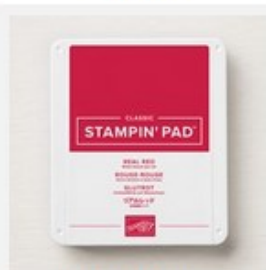
Real Red Classic Stampin' Pad [147084] $7.50