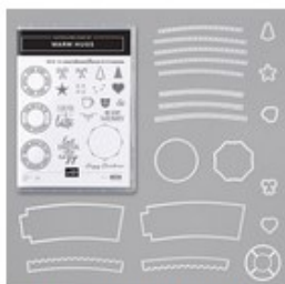
Warm Hugs Bundle (English) [155145] $46.75