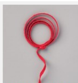
Real Red 3/16" (4.8 Mm) Braided Linen Trim [153546] $7.00