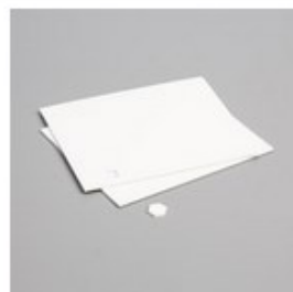
Stampin' Dimensionals [104430] $4.00