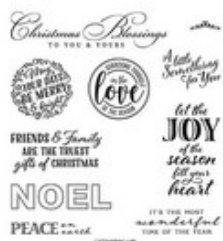
Wrapped In Christmas Cling Stamp Set (English) [153481] $22.00