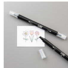
Blender Pens [102845] $12.00