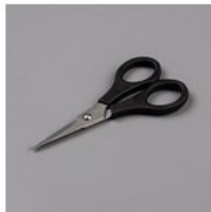
Paper Snips [103579] $10.00