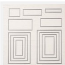
Stitched Rectangle Dies [148551] $35.00