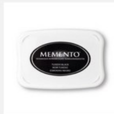
Tuxedo Black Memento Ink Pad [132708] $6.00