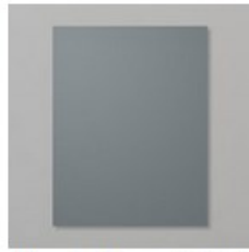
Basic Gray 8-1/2" X 11" Cardstock [121044] $8.75