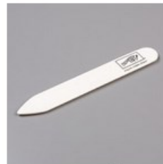
Bone Folder [102300] $7.00