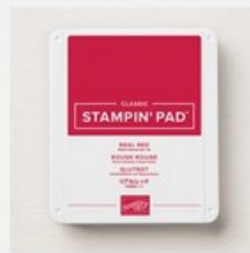
Real Red Classic Stampin' Pad [147084] $7.50