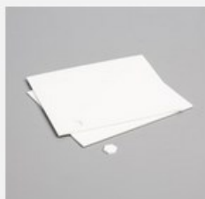
Stampin' Dimensionals [104430] $4.00