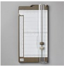
Paper Trimmer [152392] $25.00

www.mymotherschild.com pkgsmith@gmail.com (225)235-7721