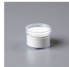
White Stampin' Emboss Powder [109132] $6.00