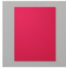
Real Red 8-1/2" X 11" Cardstock [102482] $8.75