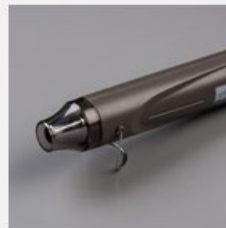
Heat Tool (Us And Canada) [129053] $30.00