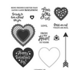
Heartfelt Photopolymer Stamp Set (English) [151417] $17.00