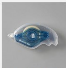
Stampin' Seal+ [149699] $12.00