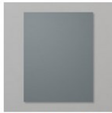
Basic Gray 8-1/2" X 11" Cardstock [121044] $8.75