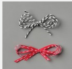
Playful Pets Trim Combo Pack [152466] $7.50