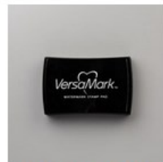
VersaMark Pad [102283] $9.50

www.mymotherschild.com pkgsmith@gmail.com (225)235-7721