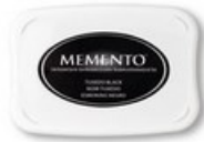
Tuxedo Black Memento Ink Pad [132708] $6.00