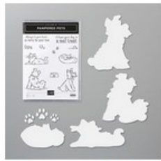
Pampered Pets Bundle [154069] $39.50