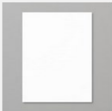
Whisper White 8-1/2" X 11" Cardstock [100730] $9.75

A Basics Supply List is on the last page. These are items that are used in almost every card or project made and will be the foundation for your crafting adventures.