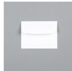
Whisper White Medium Envelopes [107301] $7.50