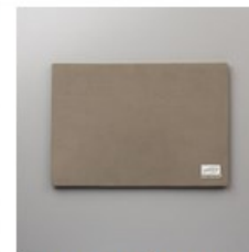
Stampin' Pierce Mat [126199] $5.00