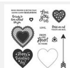
Heartfelt Photopolymer Stamp Set (English) [151417] $17.00