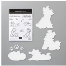
Pampered Pets Bundle [154069] $39.50