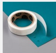
Mini Glue Dots [103683] $5.25