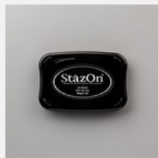
Jet Black StazOn Ink Pad [101406] $10.00