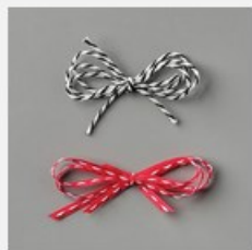
Playful Pets Trim Combo Pack [152466] $7.50