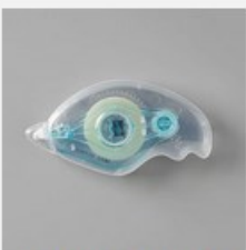
Stampin' Seal [152813] $8.00