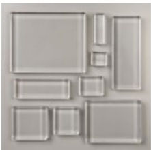
Clear Block Bundle [118491] $71.50