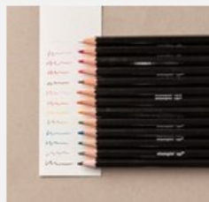
Watercolor Pencils [141709] $16.00