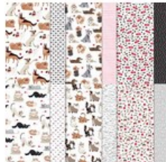
Playful Pets Designer Series Paper [152489] $11.50