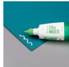
Multipurpose Liquid Glue [110755] $4.00